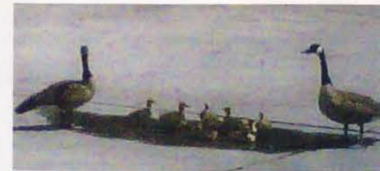
A new family of geese!