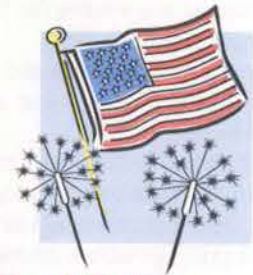
Happy Birthday, America

Will you take a week-long VACATION to the beach? Will you take a short DAYCATION to the mountains for a hike, go berry-pickin' or visit a NC winery? Or will you just enjoy some much needed rest and relaxation during your STAYCATION at home? Wherever summer takes you, enjoy your time off and rejuvenate yourself. Who knows? Maybe we'll have a busy October like we did last year!