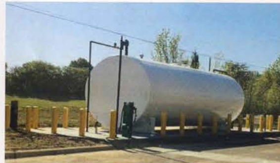
Our New Tank for Diesel Fuel

This past spring brought new and exciting things to Blair Street. Check it out!